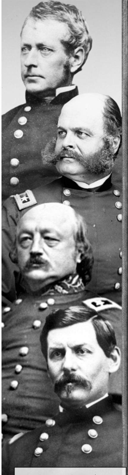
Park Members $249 Non-Members $279